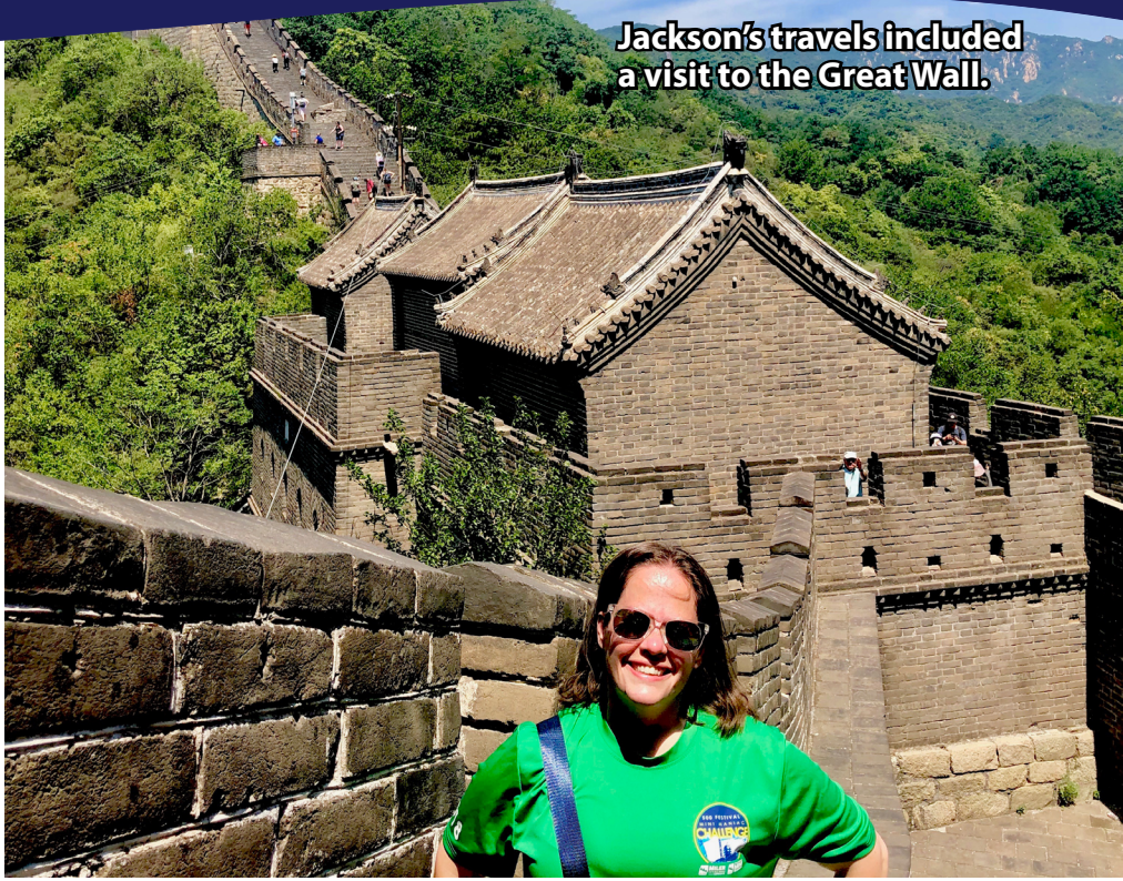
Jackson's travels included a visit to the Great Wall.

In a later write-up about the event, Chinese educators said "The first day of the